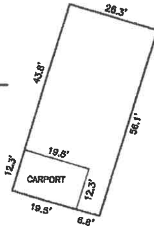
HOUSE DETAIL SCALE 1" = 20'

FLOOD NOTE: THE PROPERTY DEPICTED HEREON IS NOT WITHIN A FLOOD STUDY AREA AS DETERMINED BY THE FEDERAL EMERGENCY MANAGEMENT AGENCY; FEMA WAS THE ONLY FLOOD INFORMATION SOURCE USED FOR THIS SURVEY.